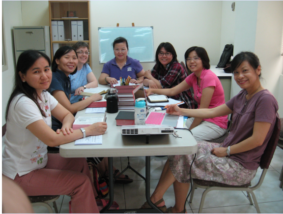
Ladies' Bible Study